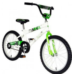
Girls / Boys bike, Donated by Ray's Bike Shop, with helmet and lock.